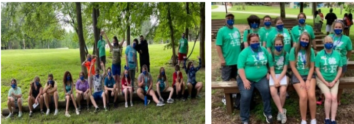
Photos from 4-H Camp 2021 with Covid-19 guidelines.

West KY 4-H Camp in Dawson Springs received only a little bit of tree damage during the December 10 th tornado outbreak. The camp facilities were used to help provide shelter to disaster relief volunteers through January.